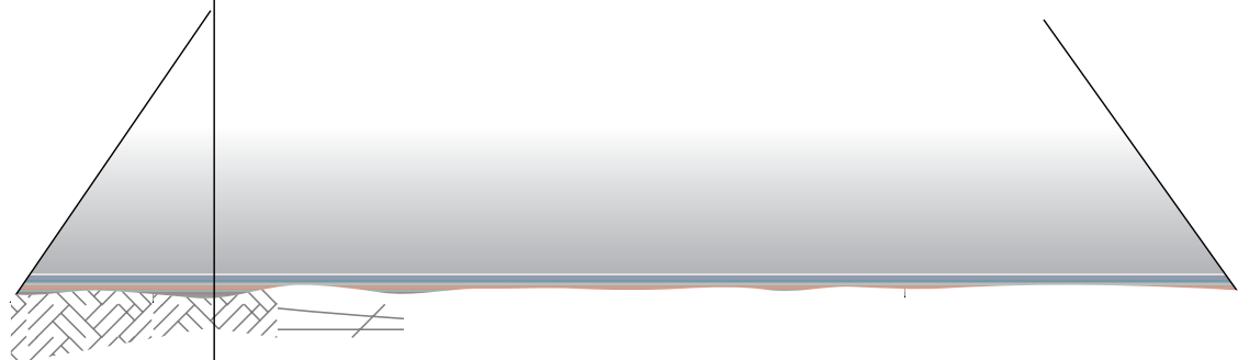
Figure 1. Temporary water storage tank, showing useful features for cold regions